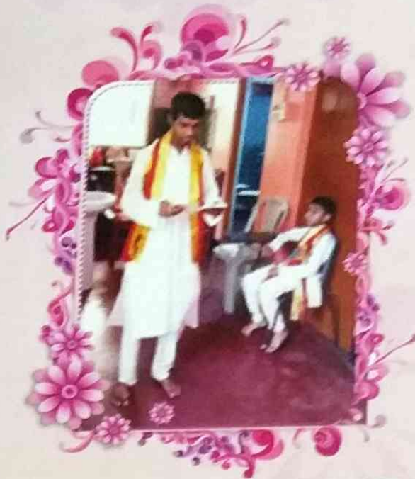
Rabindra Jayanti 2018