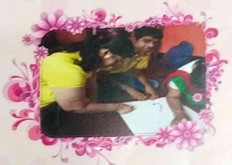
Art & Craft Class