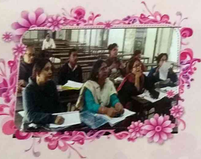
Workshop on Handwriting